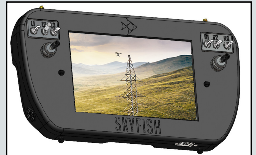
Skyfish Talon remote controller front side (L).