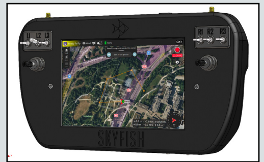
Skyfish Talon remote controller front side (R).

Based in Missoula, MT, Skyfish designs drones, battery systems, airborne guidance, and ground stations, which provide real-time video and telemetry feeds from the aircraft — all in house. Skyfish is certified Airworthiness Level 3 by U.S. Army DevCom and Green UAS (in process).