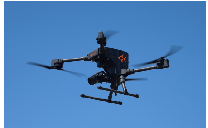
Skyfish Osprey drone with the Sony LR1 – test flying in Montana.