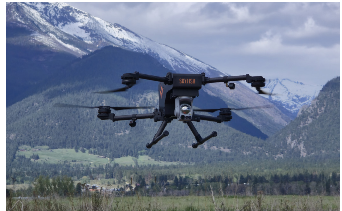
Skyfish Osprey drone with the Raptor – test flying in Montana.